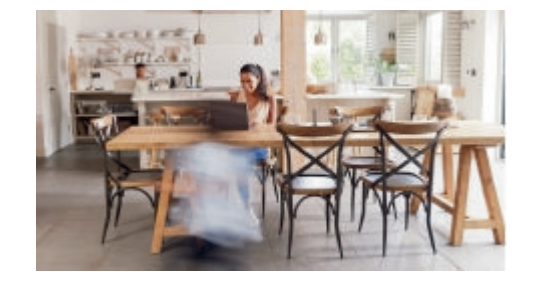
Flexible working = always working? Robert Forsyth